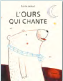
The Singing Bear Émile Jadoul