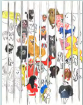
I want a dog, any dog! Kitty Crowther